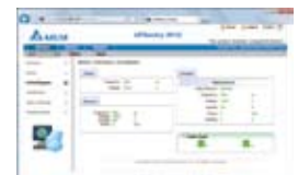
Advanced UPS Management Software - UPSentry 2012