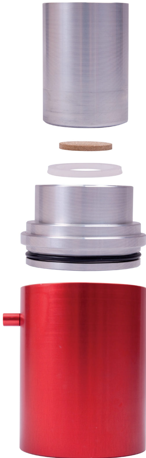
The assembly of the reservoir tube filtration base